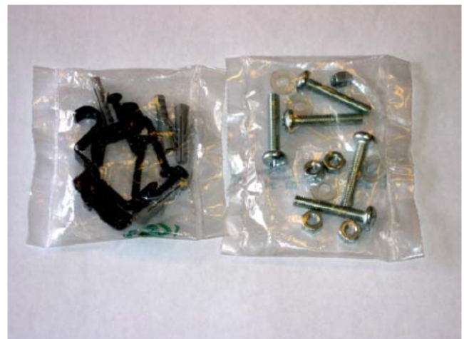
Photo: some of the kits