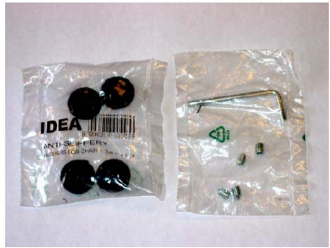
Photo: some of the kits